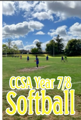
CCSA Year 7/8 Softball

Our Year 7/8 Girls and Boys softball teams had an awesome day at the the CCSA Softball tournament at Prince Edward Park in Papakura. They showed great sportsmanship and we are very proud of them.